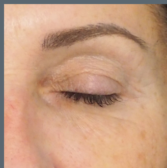
after 1 use